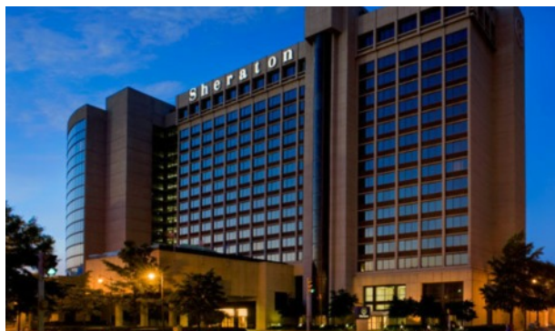
Sheraton Birmingham Hotel Birmingham, AL