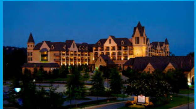
Renaissance Ross Bridge Golf Resort & Spa Birmingham, AL