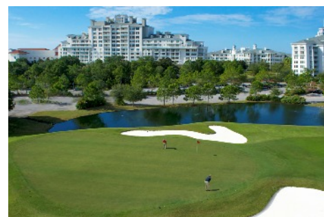
Sandestin Grand Complex